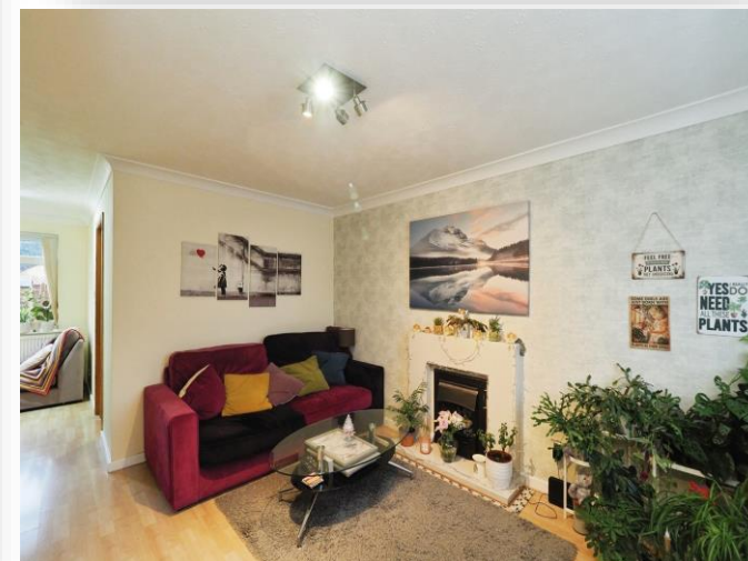
Ravensthorpe Drive, Loughborough