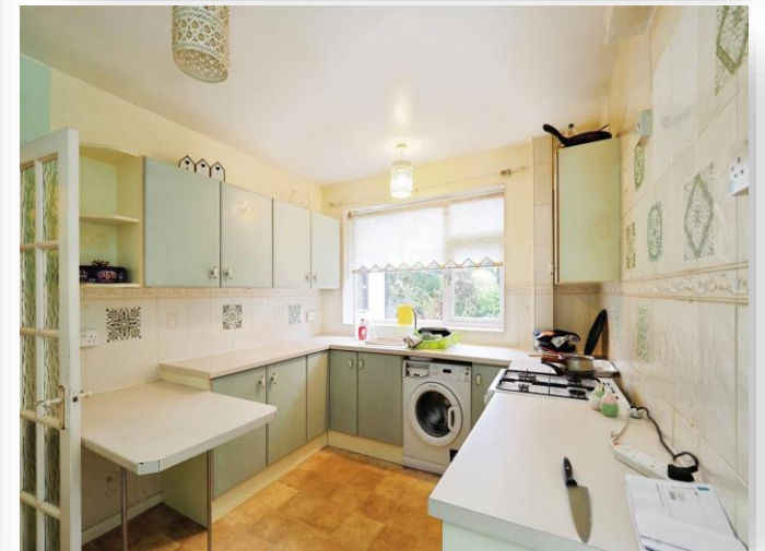
Whaddon Drive, Loughborough