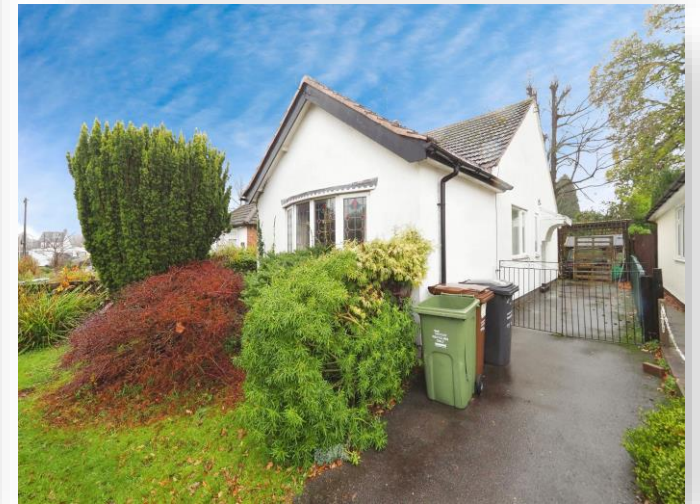
Whaddon Drive, Shelthorpe