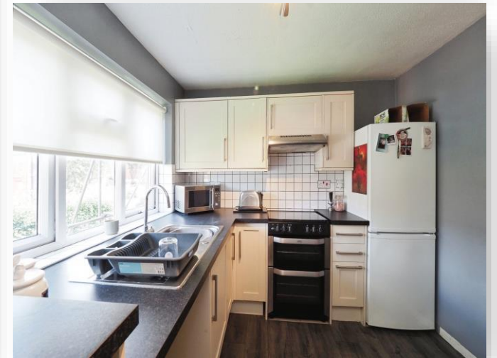
Peel Drive, LOUGHBOROUGH