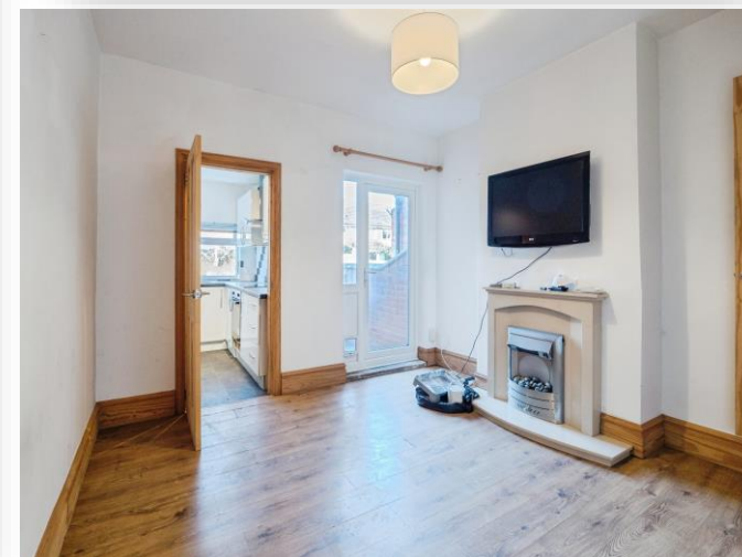
King Street, Loughborough LE11 1SD