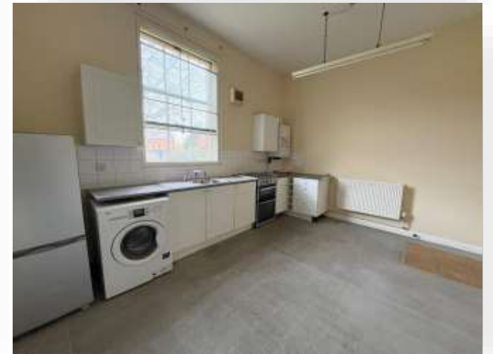
Towles Mill Queens Road, Loughborough