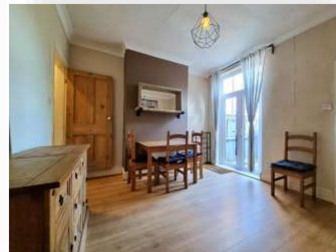
Russell Street, LOUGHBOROUGH