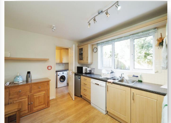
Haymeadow Close, Loughborough