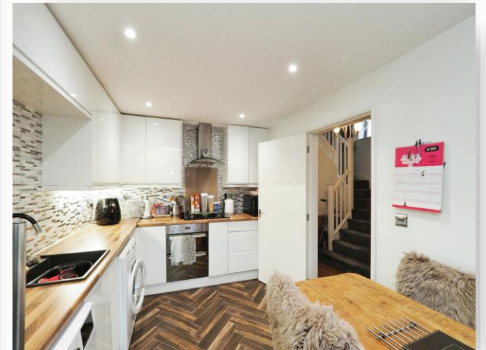
Stableford Close, Shepshed