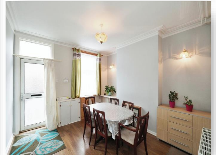
Thomas Street, Loughborough