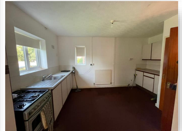
Old Ashby Road, Loughborough