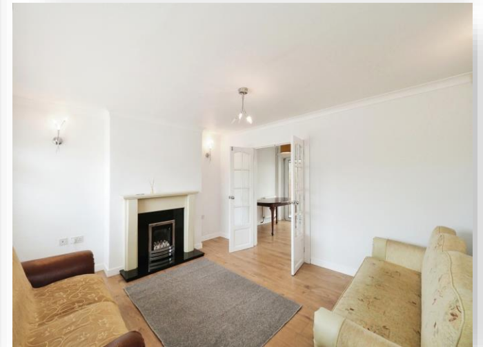
Kensington Avenue, Loughborough