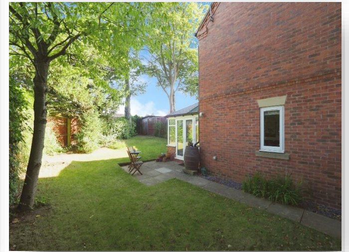
Buddon Court Linden Grove, Mountsorrel