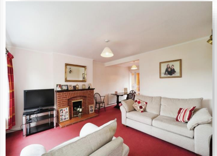
Trinity Crescent, Wymeswold Loughborough