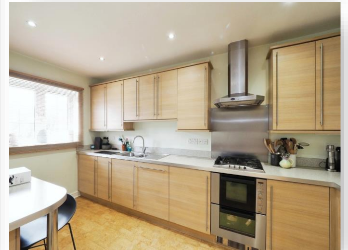
Vale Close, LOUGHBOROUGH