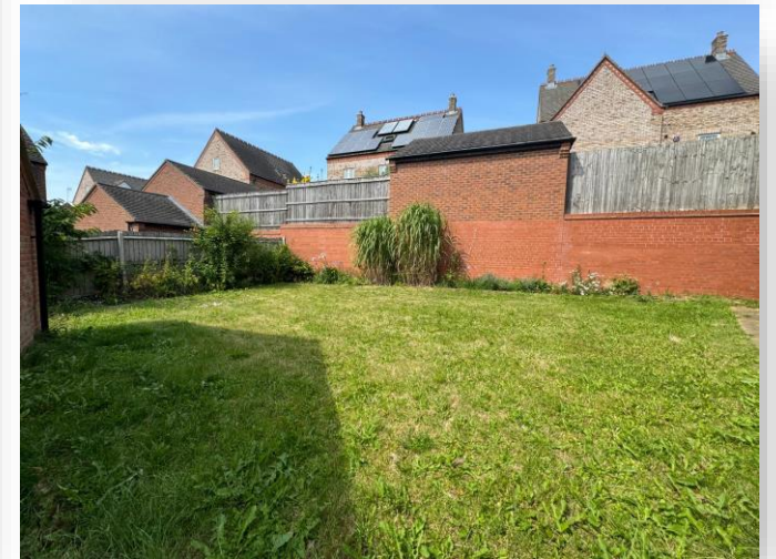
Sharter Drive, Loughborough