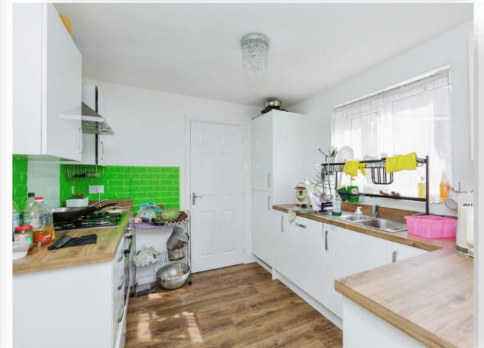
Woodpecker Way, Shepshed