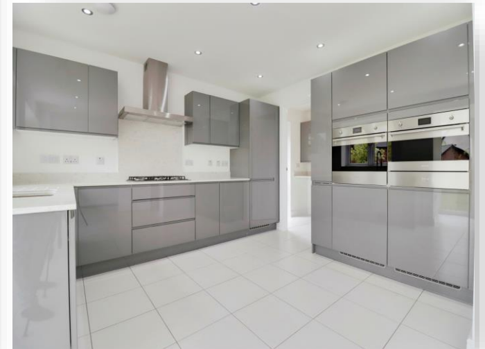
The Kingsbury, Park Lane, Sutton Bonington