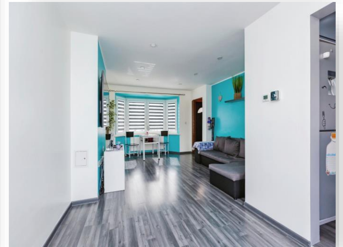
Chalfont Drive, Sileby