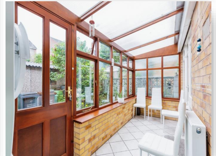
Althorpe Drive, Loughborough