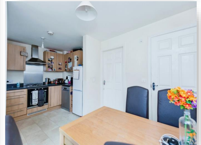
Willow Road, Barrow Upon Soar