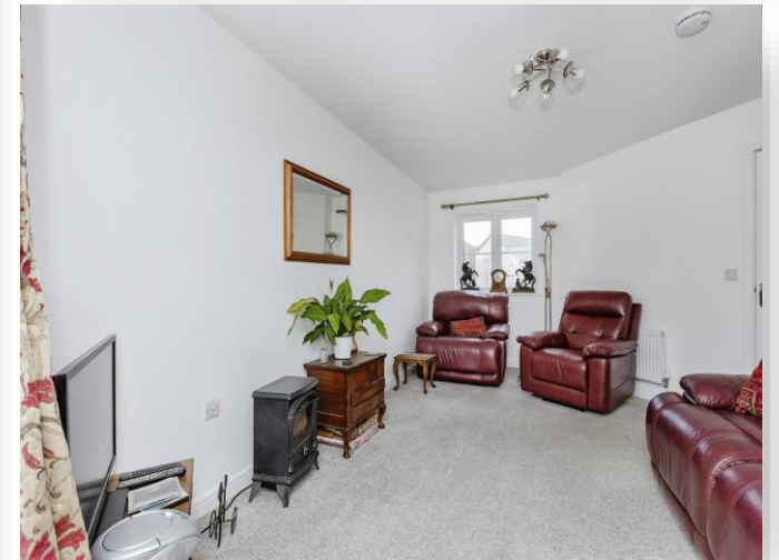
Field Edge Drive, Barrow Upon Soar