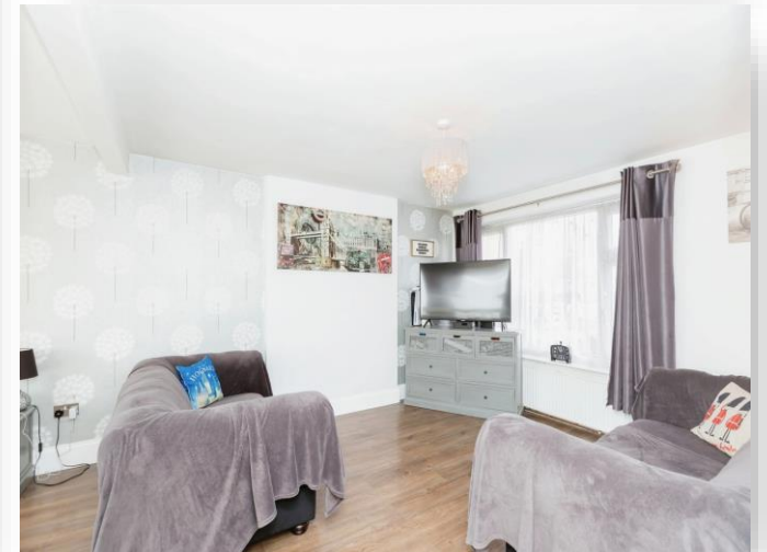
Raymond Avenue, Loughborough