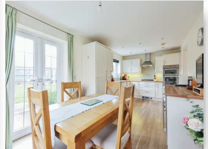
Alan Turing Road, LOUGHBOROUGH