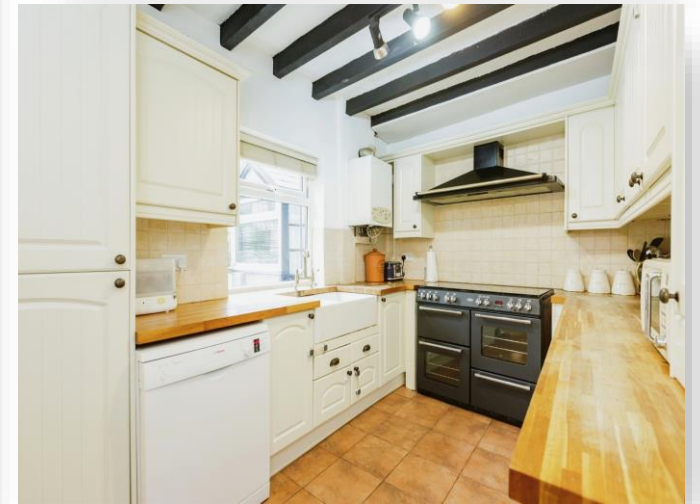
Leicester Road, Mountsorrel