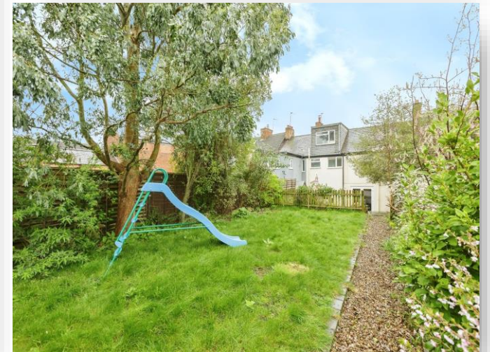
Leicester Road, Mountsorrel, Loughborough