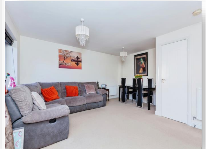
Leslie Yoxall Drive, Loughborough LE11 2GH