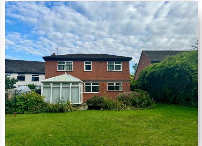
Pitsford Drive, Loughborough