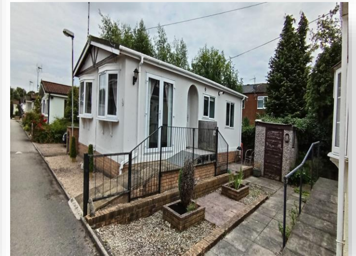
Palma Park Shelley Street, Loughborough