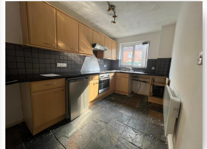
Mill Lane, Loughborough