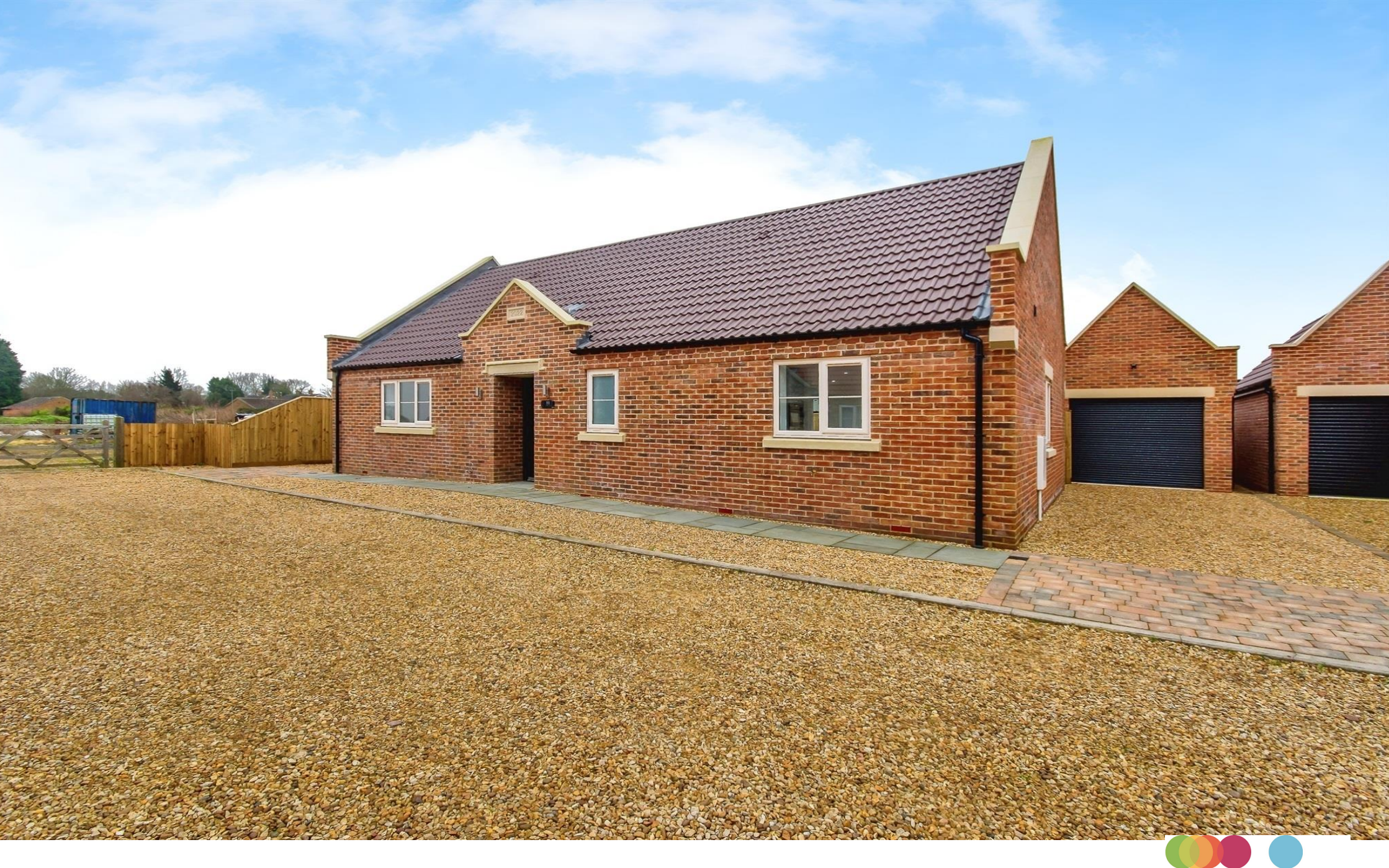
Hillgate, Gedney Hill Spalding PE12 0NN