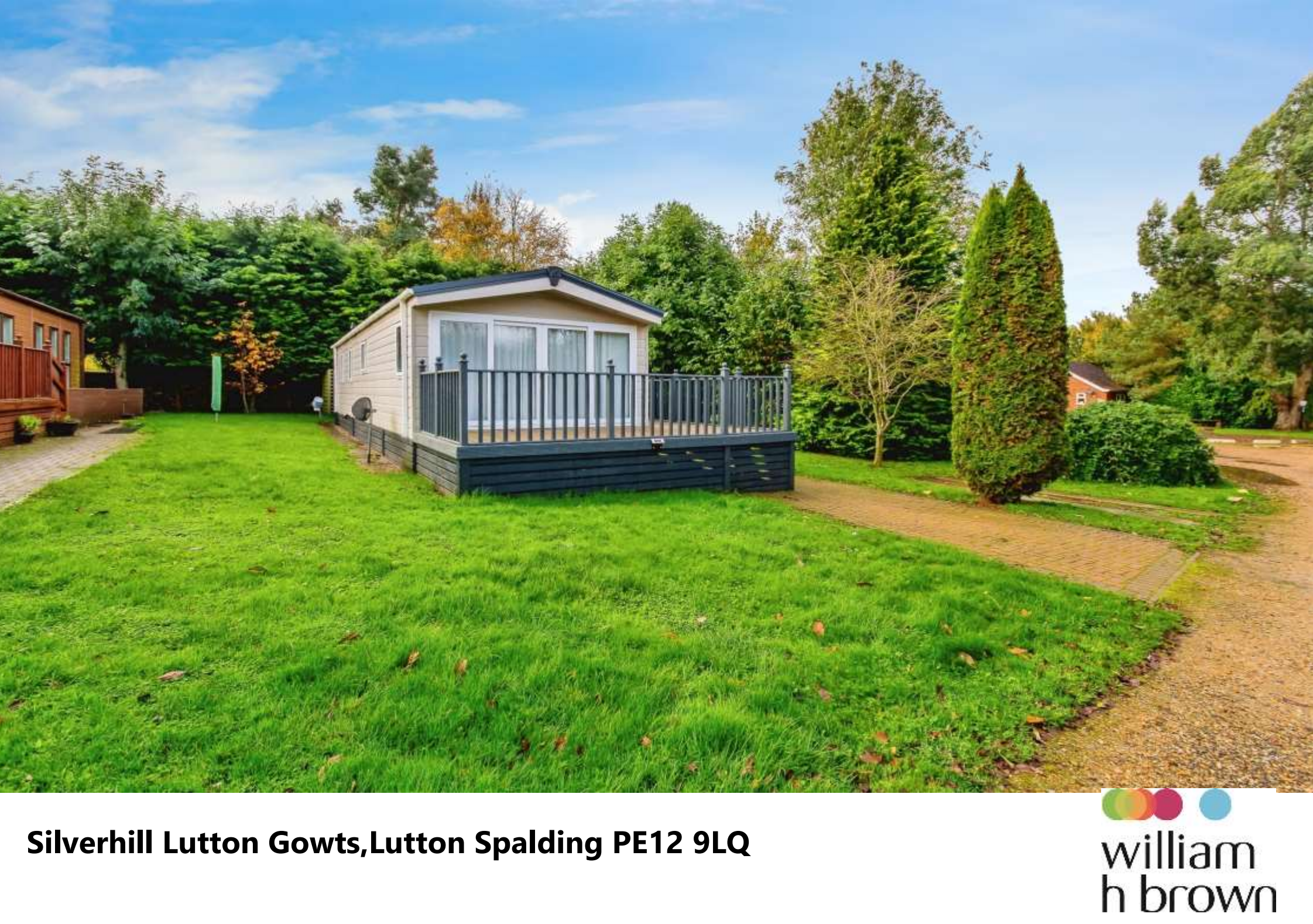
Silverhill Lutton Gowts, Lutton Spalding PE12 9LQ