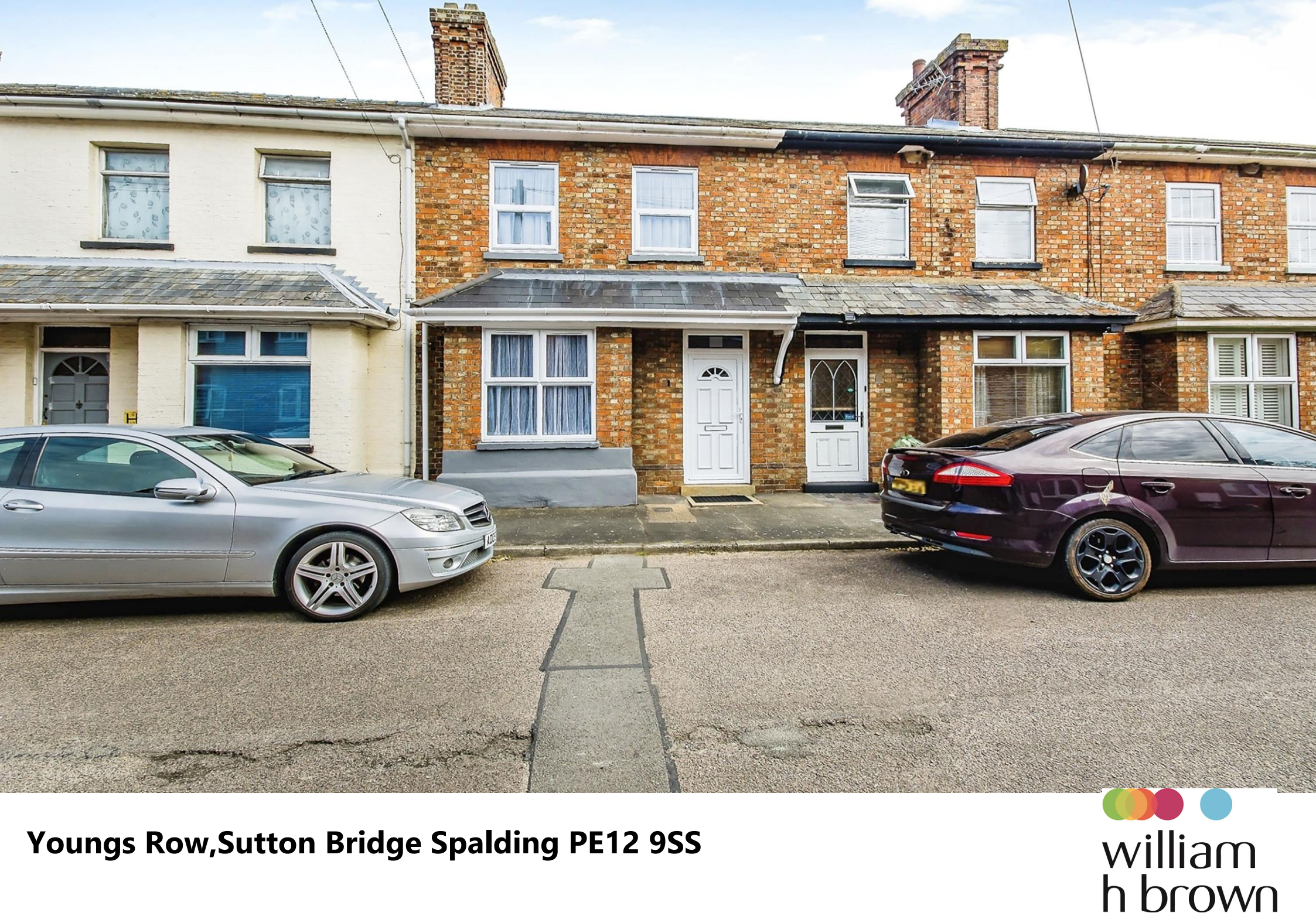
Youngs Row, Sutton Bridge Spalding PE12 9SS