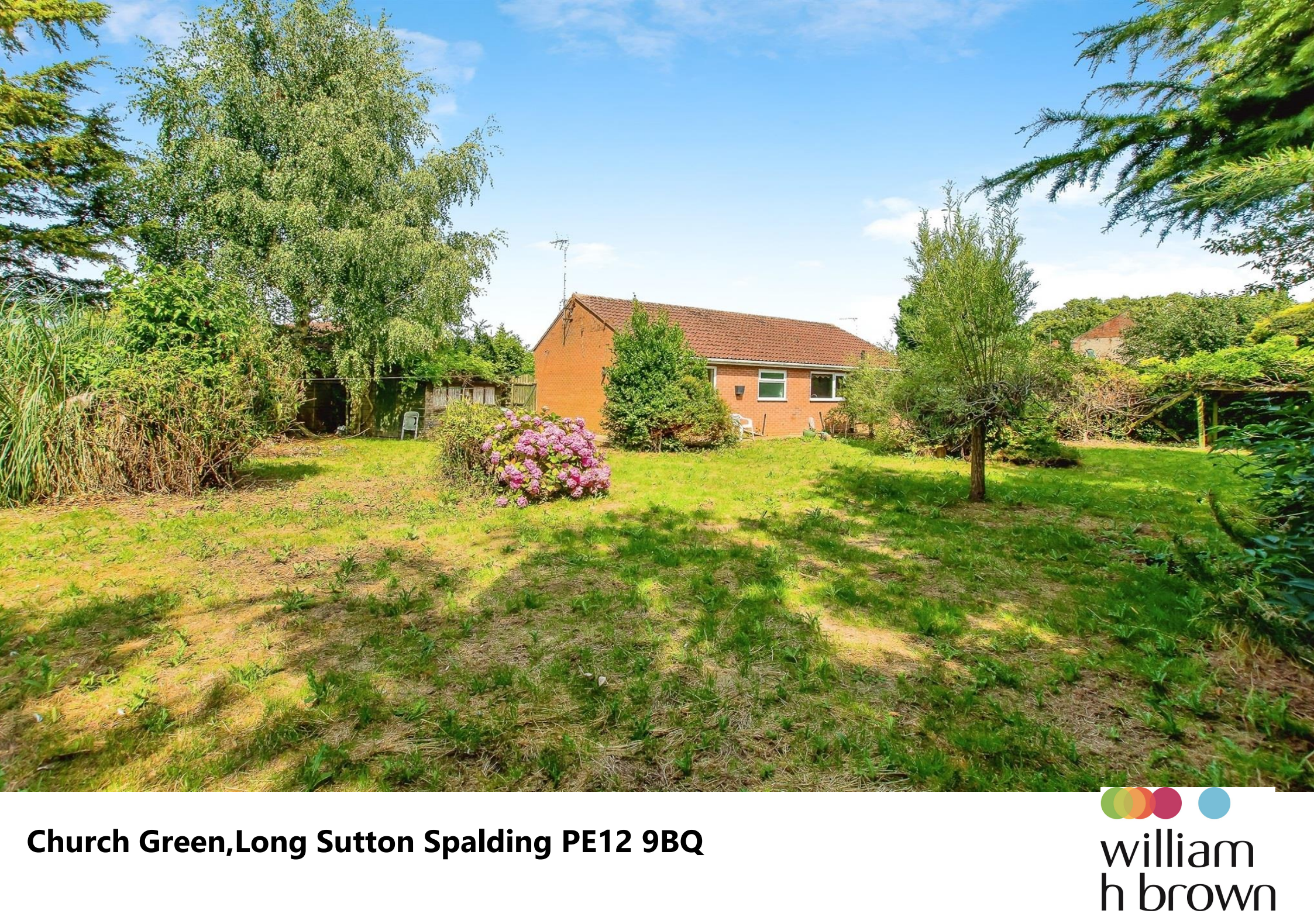
Church Green, Long Sutton Spalding PE12 9BQ