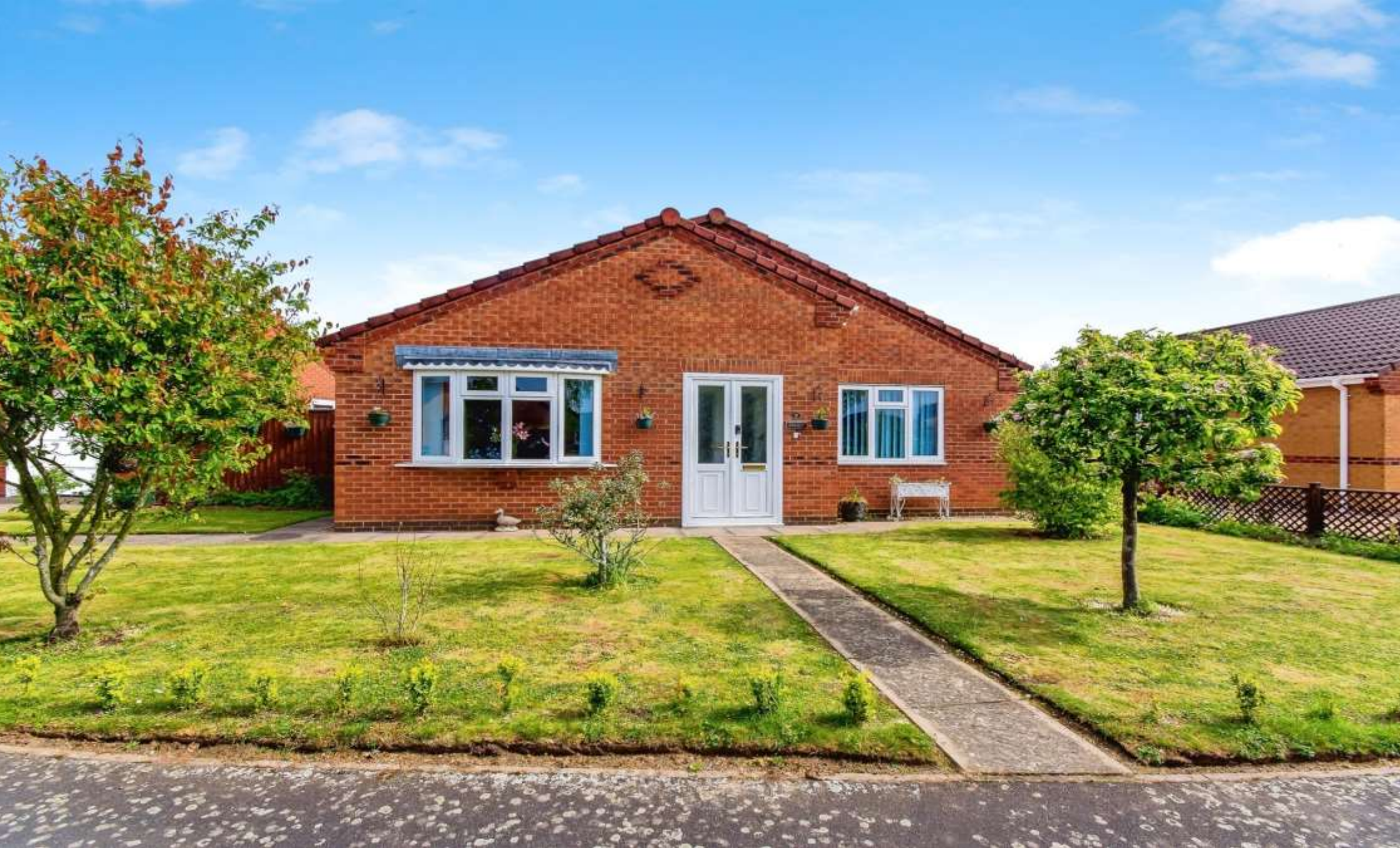
The Sidings, Long Sutton Spalding PE12 9FA