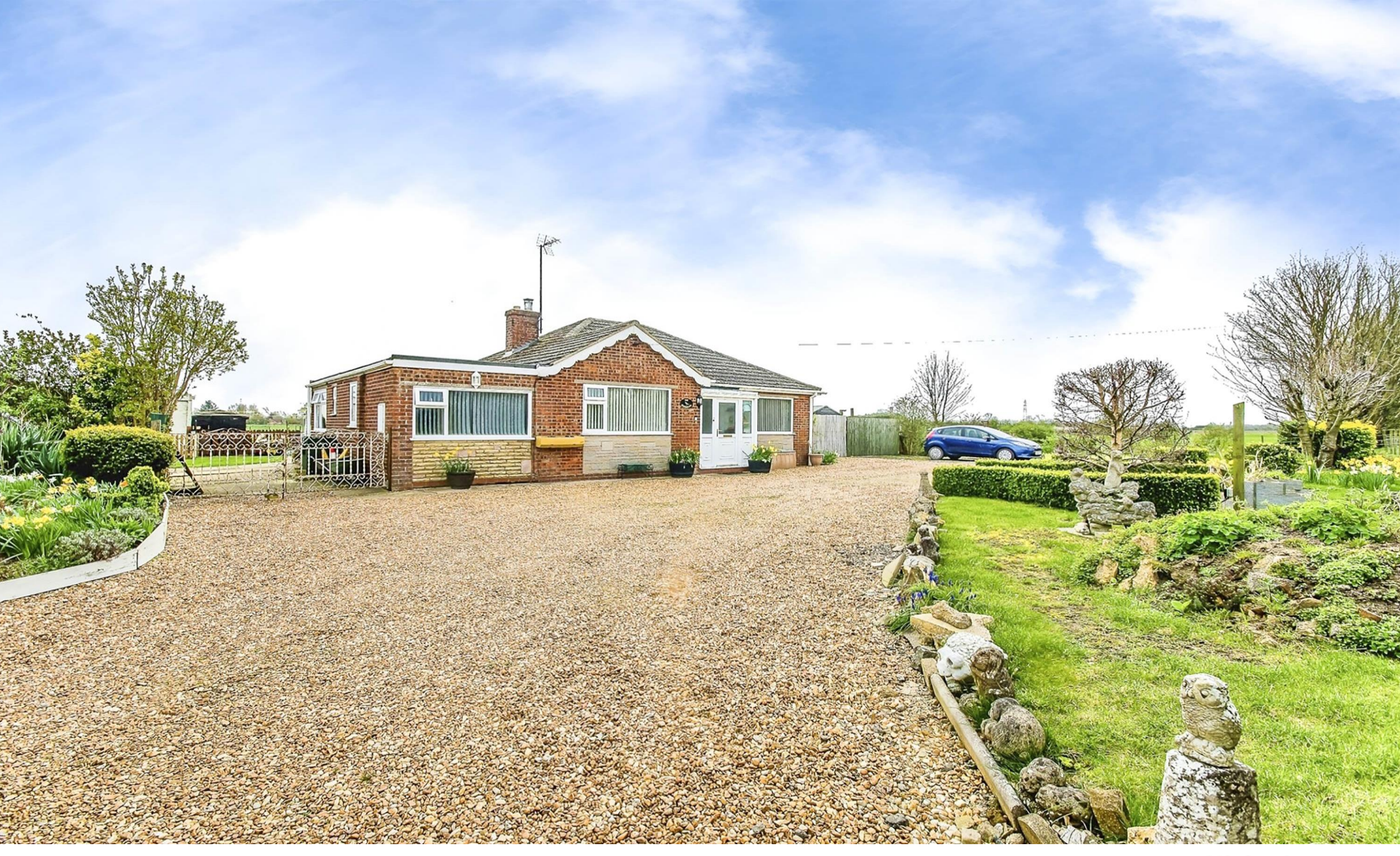
The Bungalow Jarvis Gate, Sutton St. James SPALDING PE12 0EP