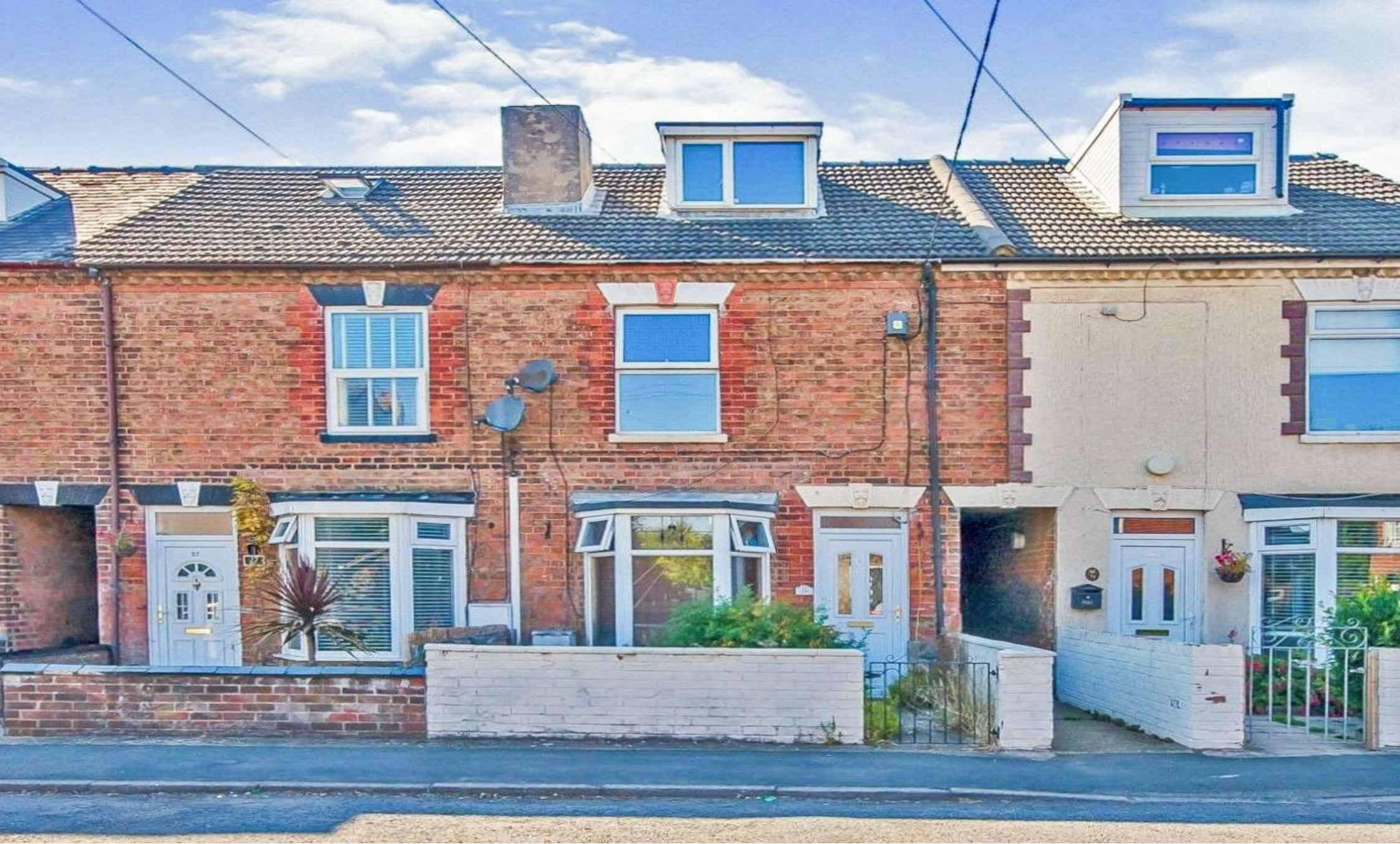
Chestnut Terrace, Sutton Bridge Spalding PE12 9SX