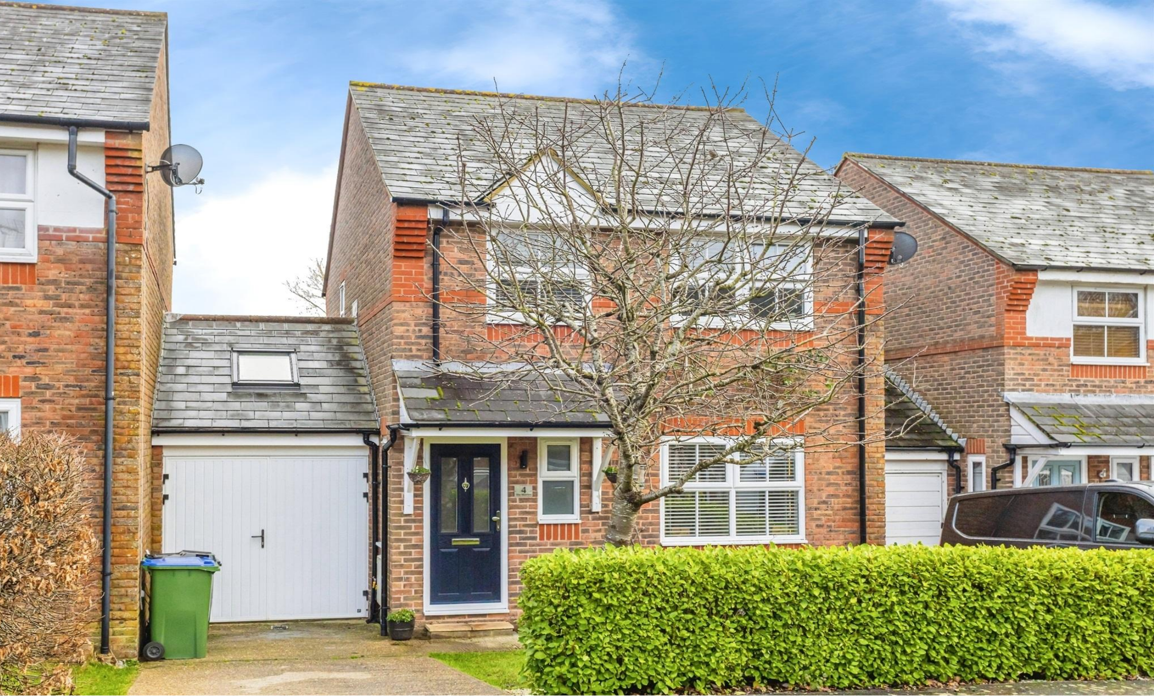
The Martlets, South Chailey, Lewes BN8 4QG