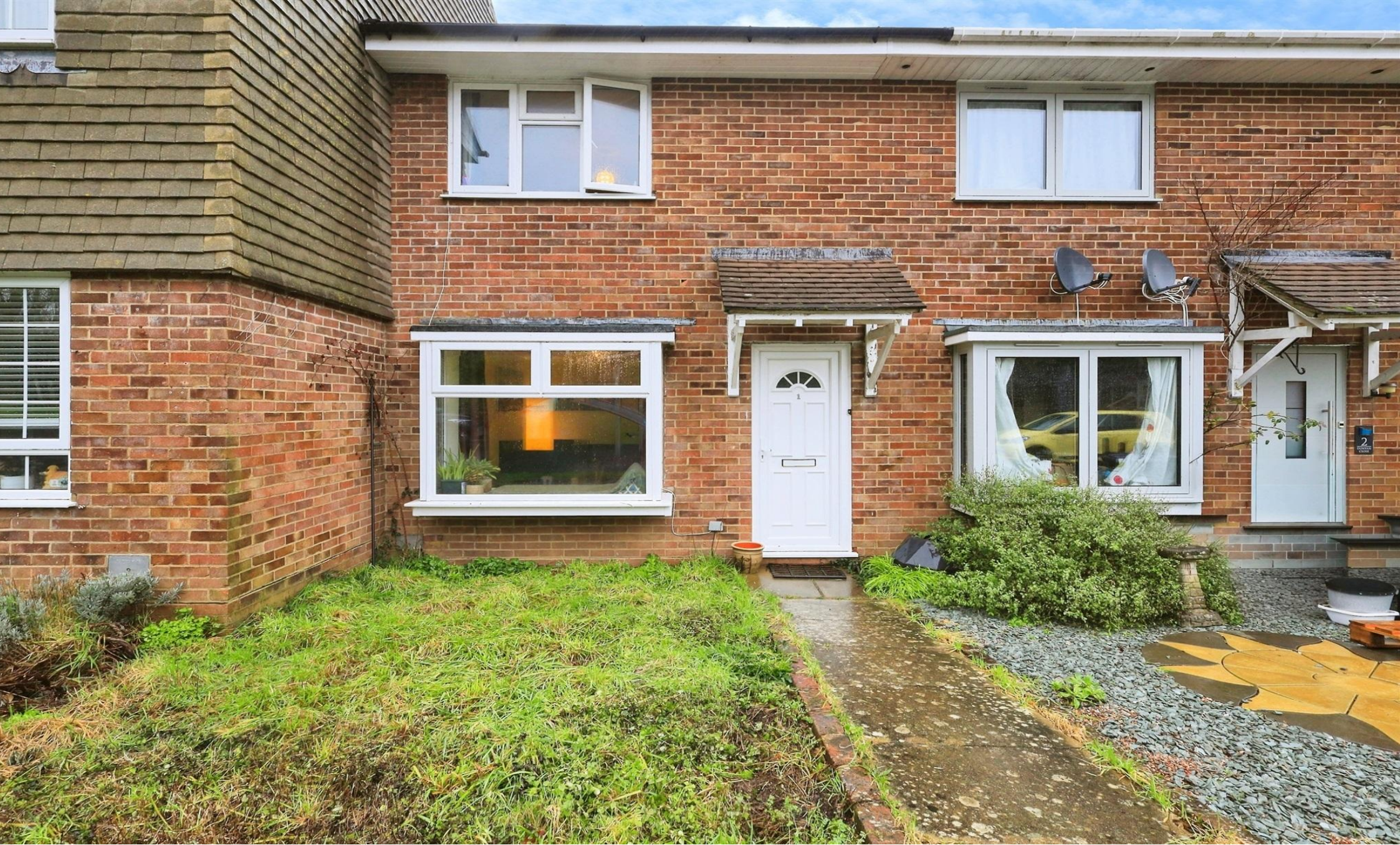
Dunvan Close, LEWES, BN7 2EY