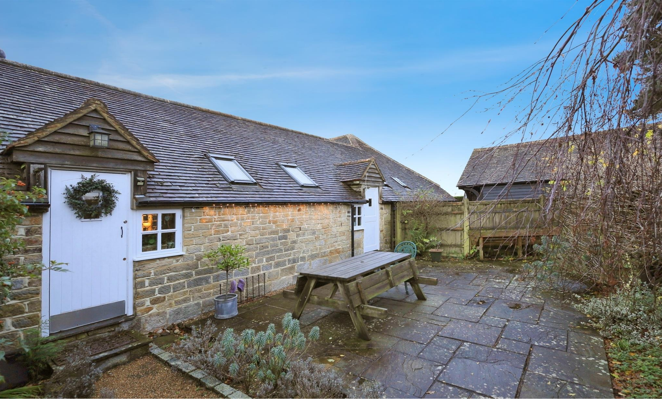
The Bothy Green Lane, Crowborough TN6 2XB