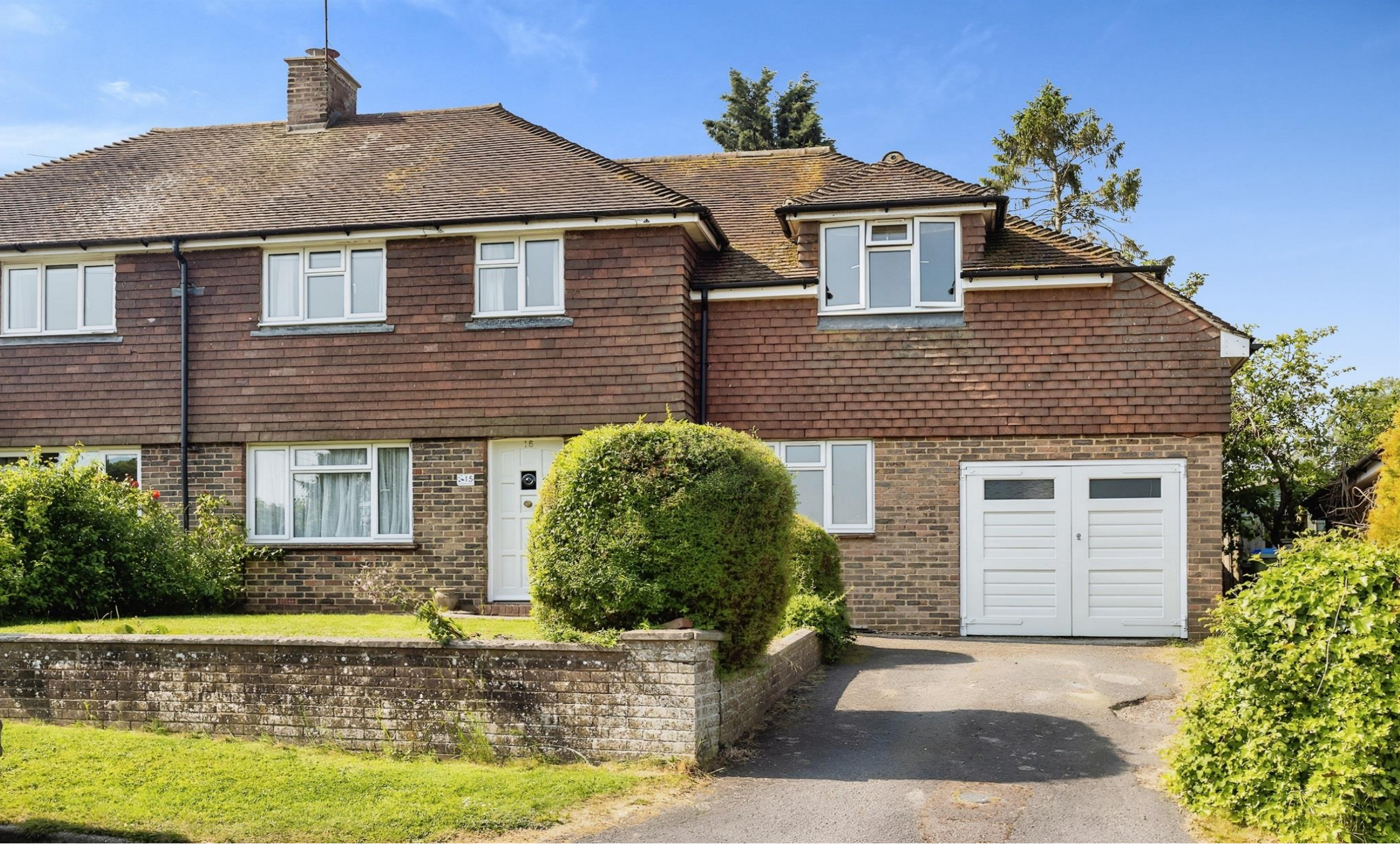
Markstakes Corner, South Chailey Lewes BN8 4BP