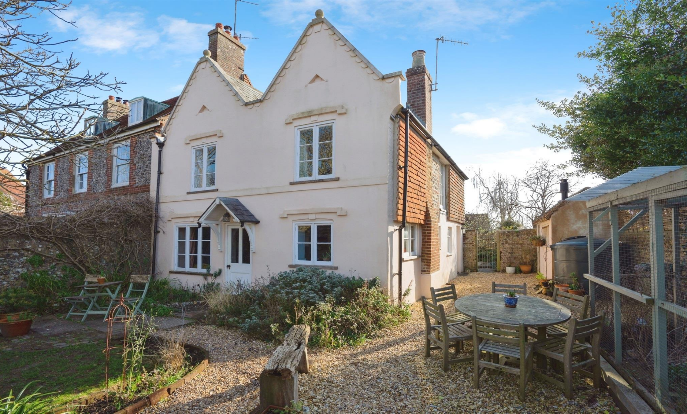
Cobblers Cottage Village Green, Piddinghoe Newhaven BN9 9AP