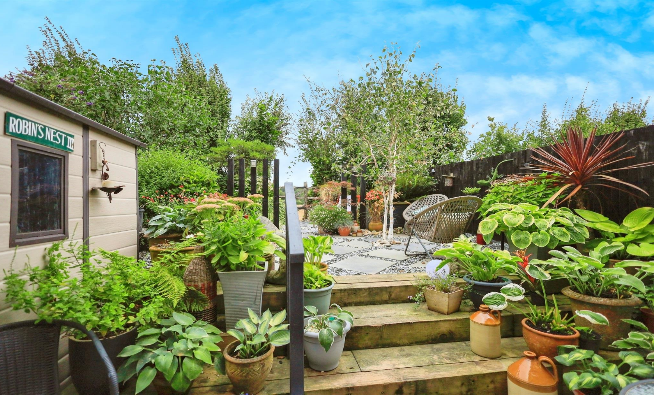
Chatfield Close, Cocksbridge LEWES BN8 4FF