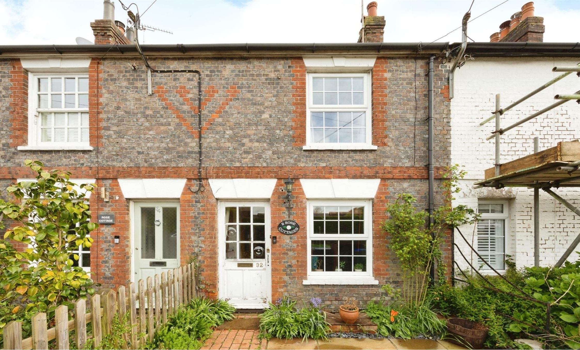
High Street, Newick, Lewes BN8 4LQ