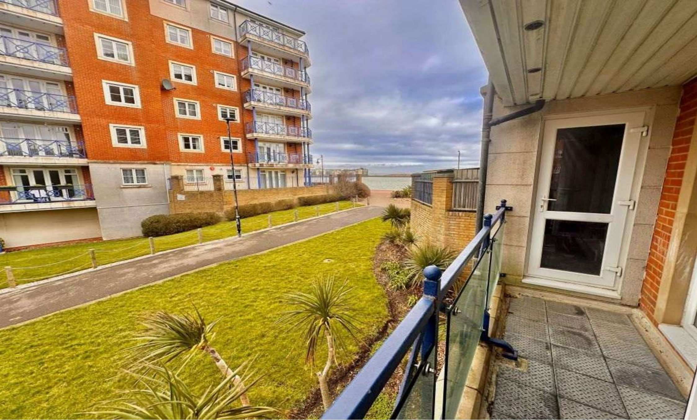
San Juan Court, Eastbourne BN23 5TP