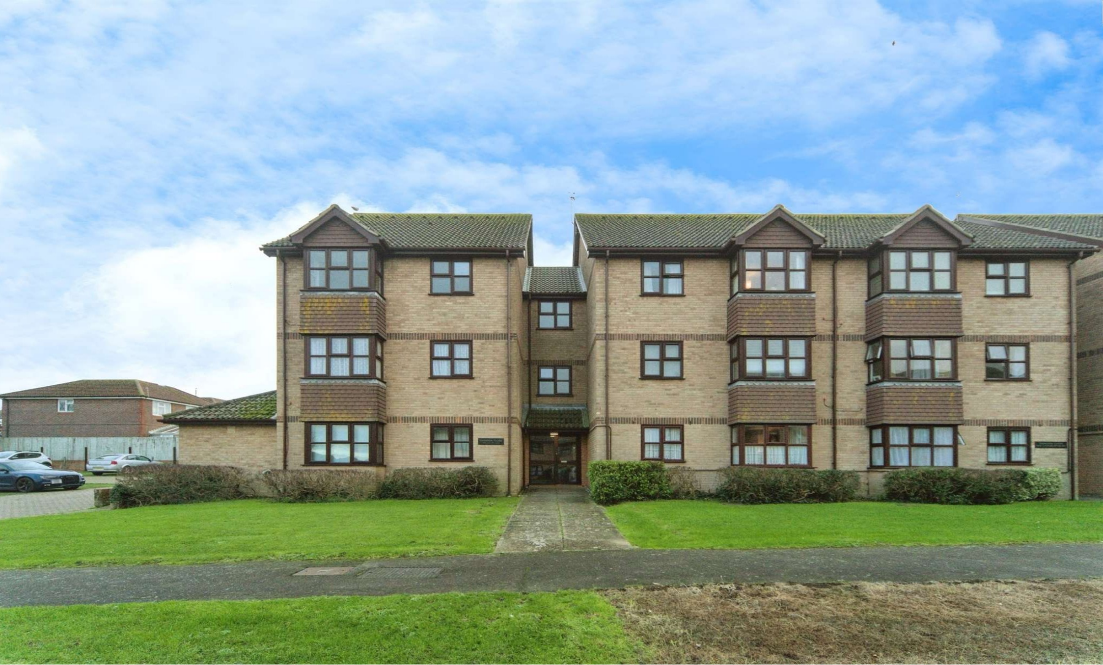
Snowdon Close, Eastbourne BN23 8HW