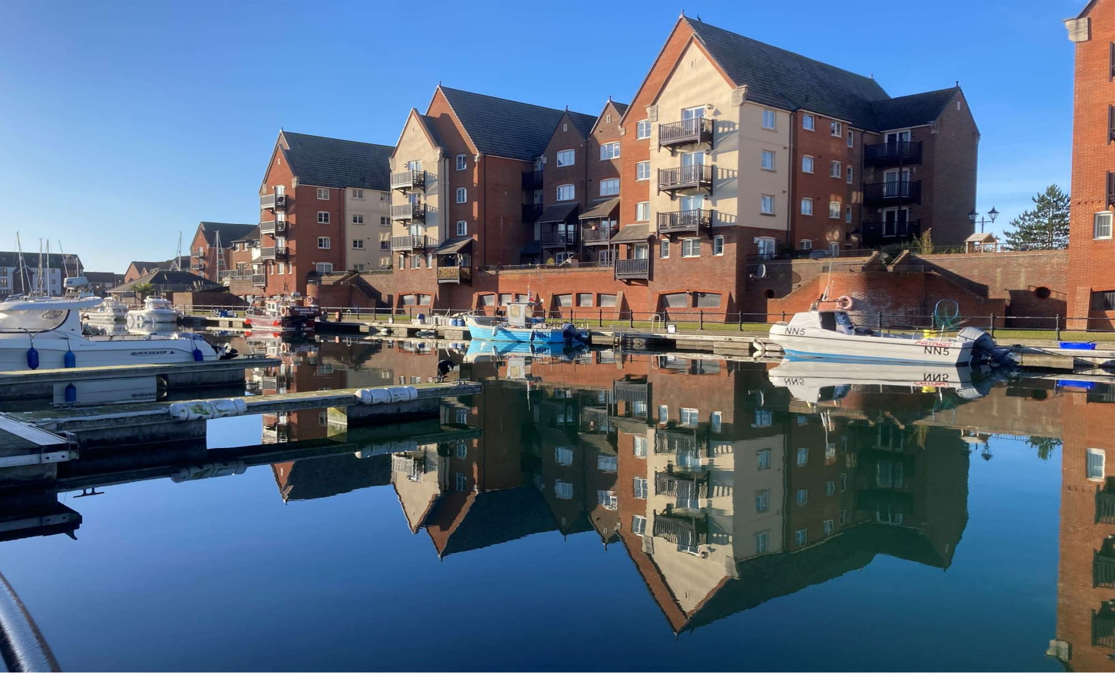
Daytona Quay, Eastbourne BN23 5BN