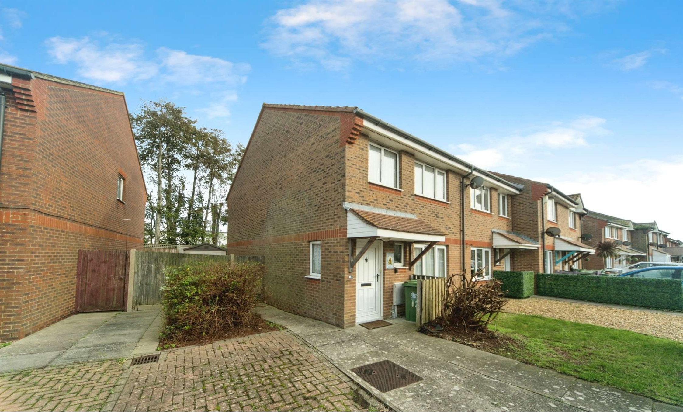
Hereward Road, Eastbourne BN23 6TG