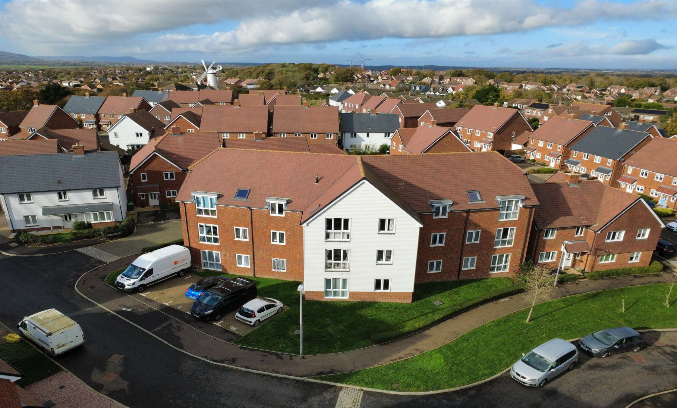
Yarrow Place, Stone Cross Pevensey BN24 5GG