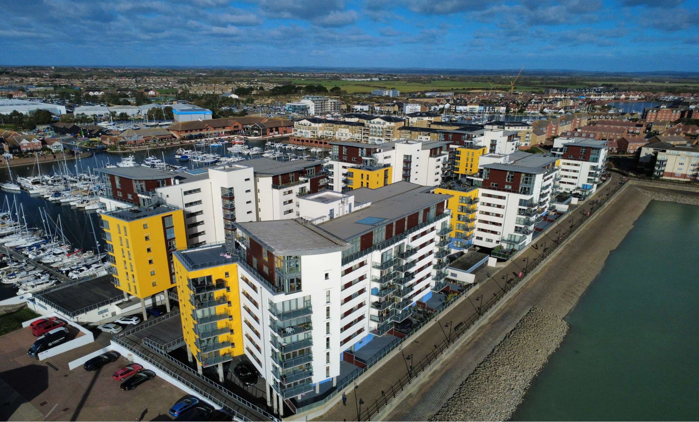
Orvis Court Midway Quay, Eastbourne BN23 5DF